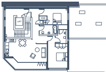
Apartments: 16 (4 th floor) and 17 (5 th floor)